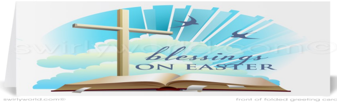
swirlyworld.com© front of folded greeting card