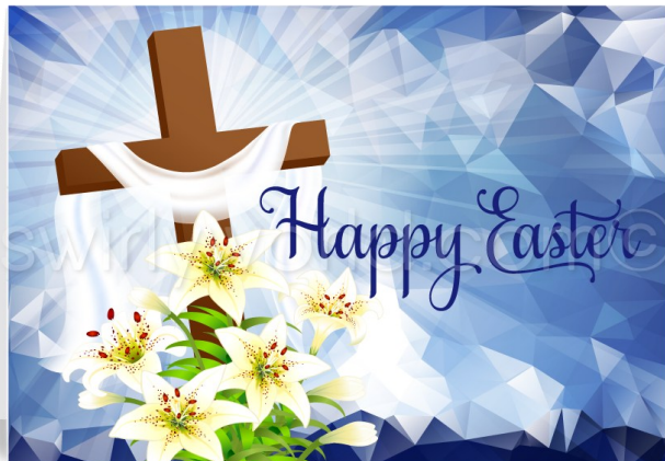
swirlyworld.com© front of folded greeting card