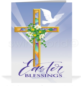
front of card